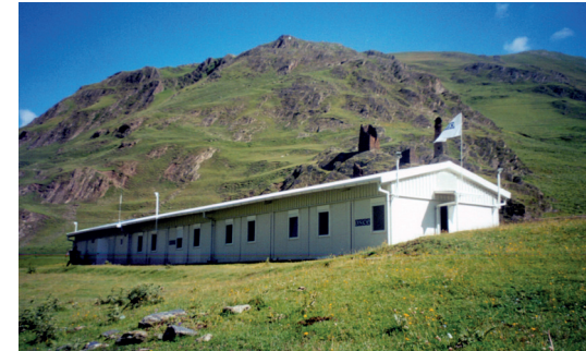
Accommodation Units OSCE, Girevi, Georgia