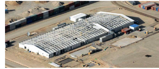
Hospital, Kandahar, Afghanistan