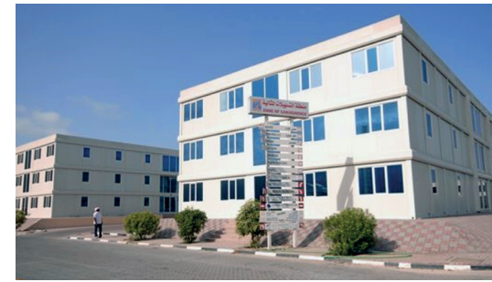
Free Zone Authority, Fujairah, UAE