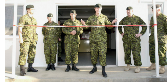
Accommodation Units and Medical Facility, Bugojno, BiH