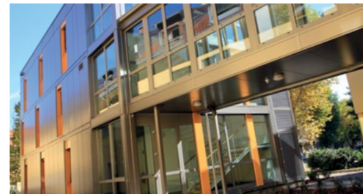
Faculty of Medicine, Ljubljana, Slovenia