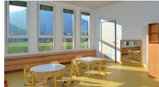
Kindergarten Biba, Škofja Loka, Slovenia