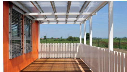
Kindergarten, Podpeč, Slovenia