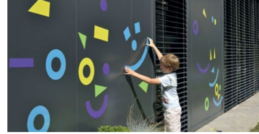
Kindergarten Ajda, Ravne na Koroškem, Slovenia

Kindergarten Biba, Škofja Loka, Slovenia