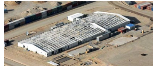
Hospital, Kandahar, Afghanistan