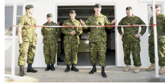
Accommodation Units and Medical Facility, Bugojno, BiH