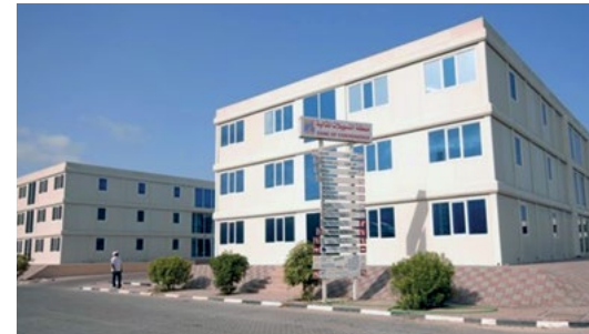
Free Zone Authority, Fujairah, UAE