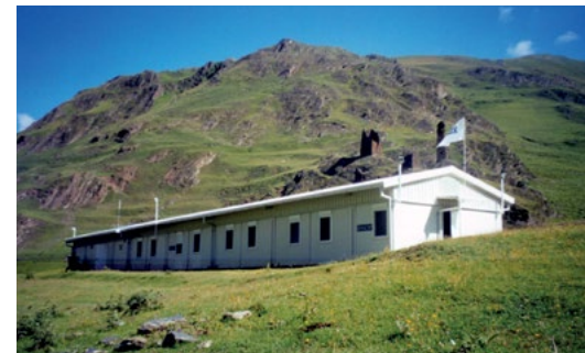
Accommodation Units OSCE, Girevi, Georgia